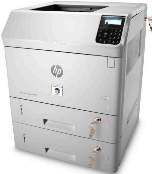
TROY M606 MICR Secure Ex